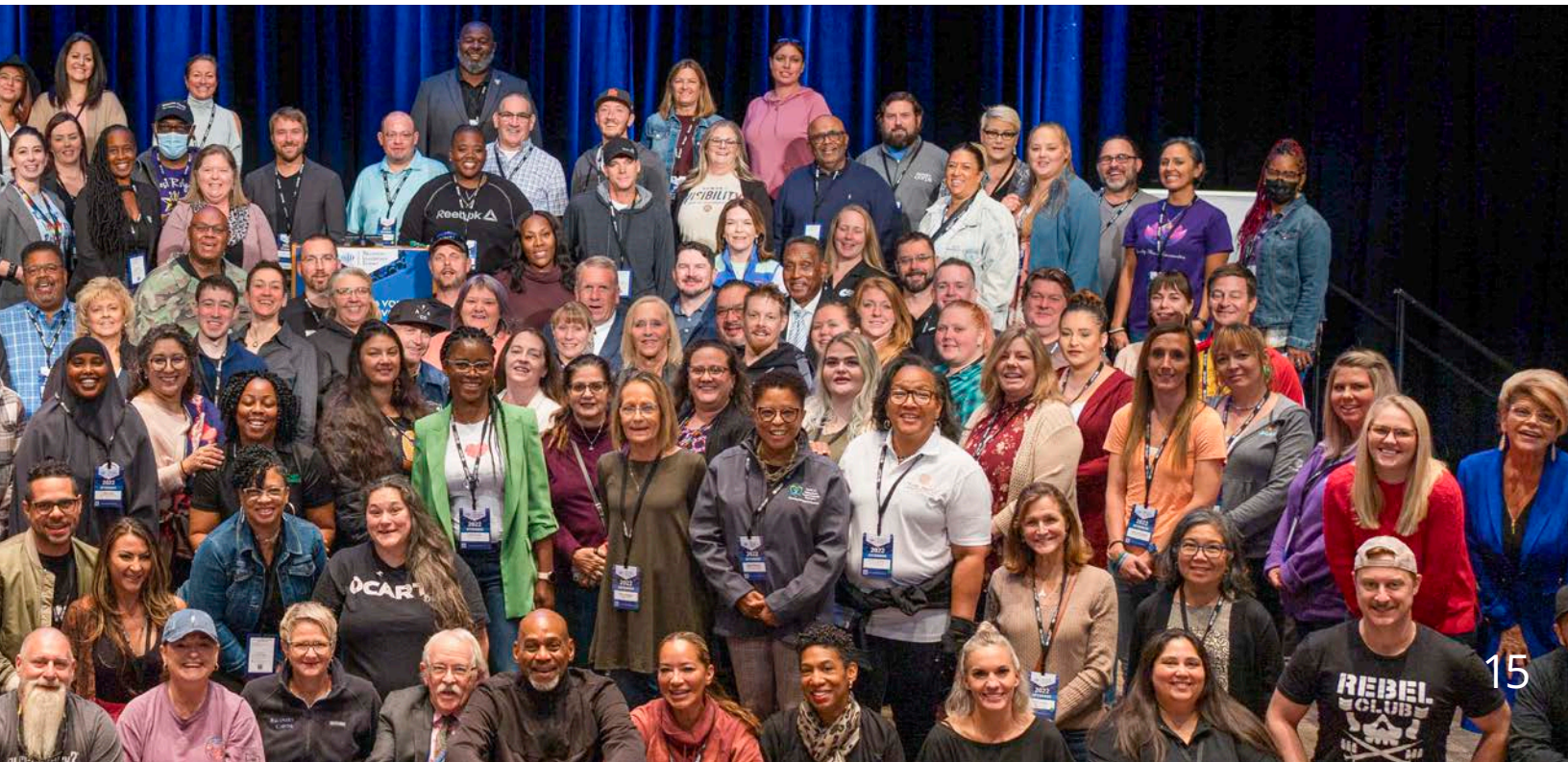
2022 RLS attendees in St. Paul, MN

However, we know that our work isn't done yet. The challenges are many, and our commitment is steadfast. The fight for a more equitable and compassionate society for all of us continues.