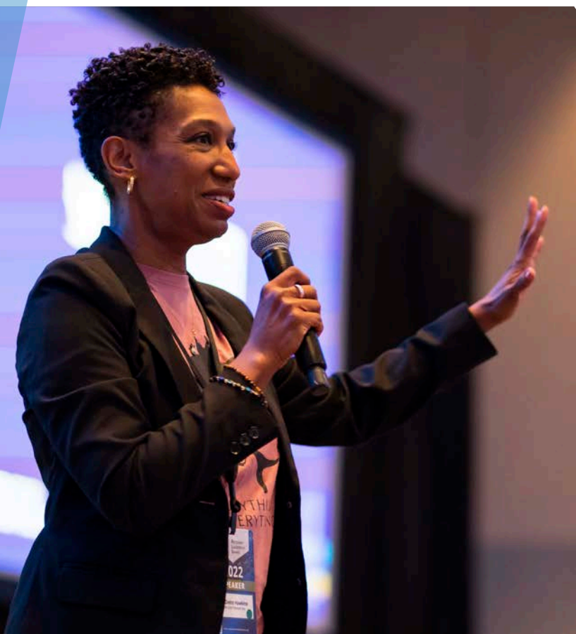
2022 RLS in St. Paul, MN

IRD blends seamlessly into Faces & Voices core service – advocacy. Continuing the tradition of International Recovery Day embraces Faces & Voices mission to change the way addiction and recovery are understood and embraced through advocacy, education, and leadership.