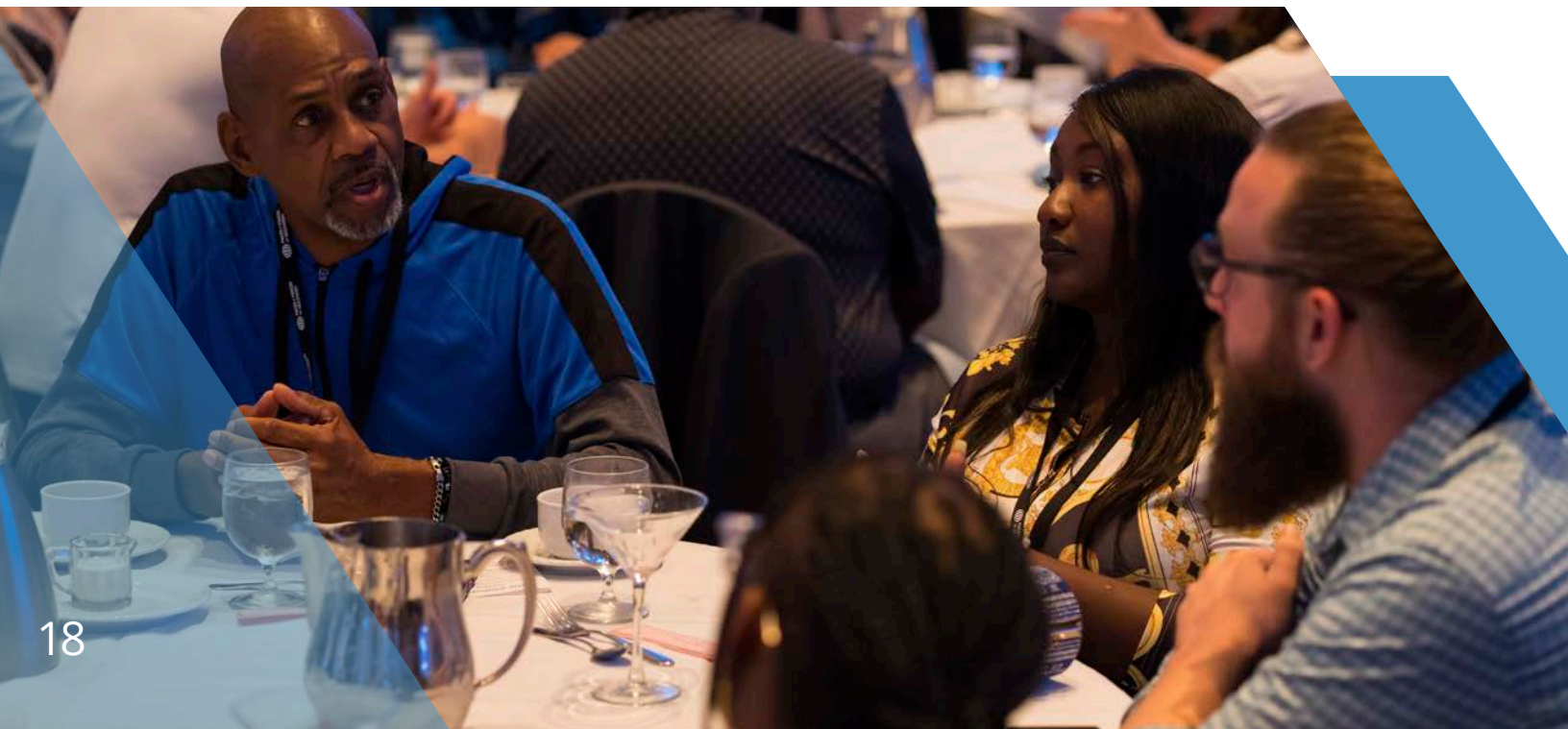
2022 RLS in St. Paul, MN

At Faces & Voices, we proudly lead the charge in building a recovery-ready nation that benefits everyone. Our policy agenda creates comprehensive support services, accessible social determinants of care, and ensures that people with lived experience are at the forefront of every decision that impacts them.